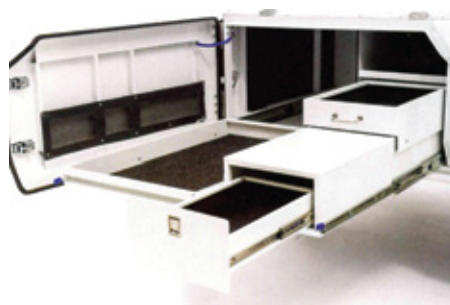
Triple Pantry Drawer & fridge slide fitting large family size fridge