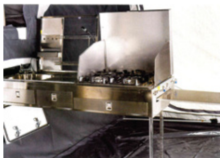
Stainless Steel Kitchen with 4 Burner Stove