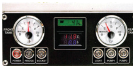
Power control panel with water tank indicators